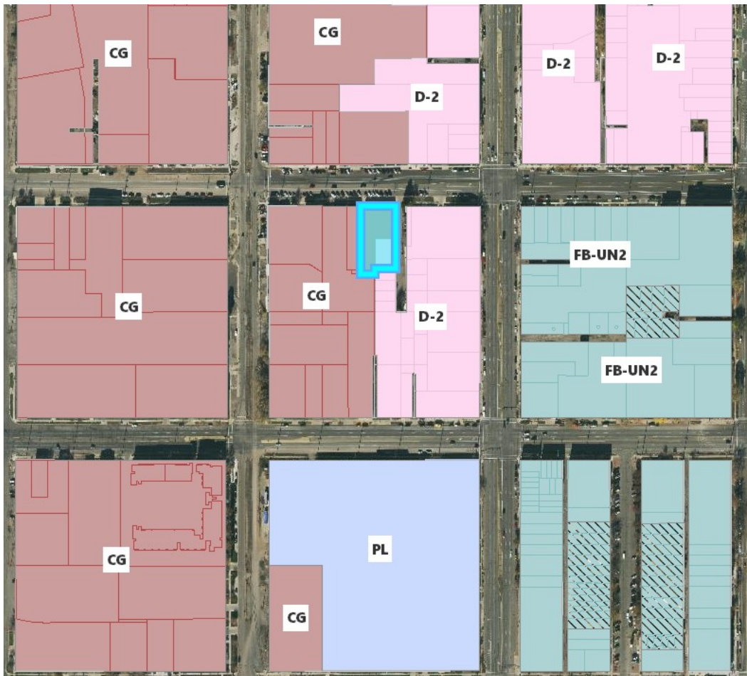
Area zoning map with subject parcel highlighted in blue.

As shown in the map below, area zoning is primarily D-2 fronting the west side of 300 West, Kilby Court, and portions of 700 South. CG zoning is found on 700 South west of the subject property. FB-UN2 (Form Based Urban Neighborhood) is to the south and east of the property. The Fleet Block is located on the block to the south.