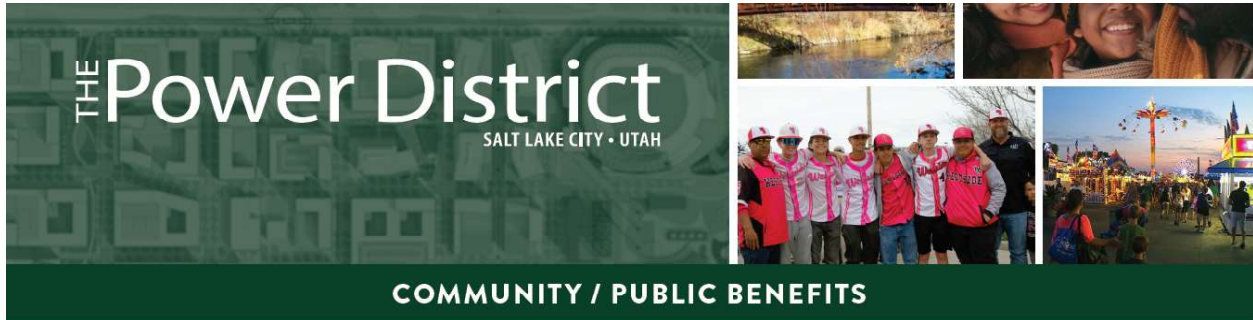
EXHIBIT F [Community Statement]