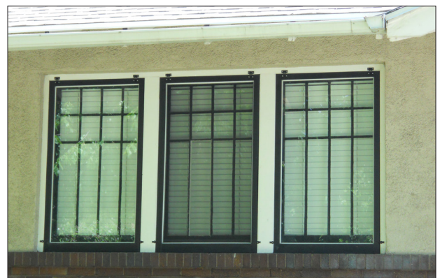
External storm windows combined with the original windows can outperform replacements in acoustic and energy terms.