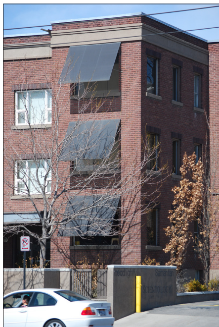
Traditional methods of providing solar shading remain just as effective today.

These design guidelines advise on a number of matters which should help to enhance an integrated consideration of best sustainable development practice in a historic setting.