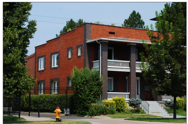
The traditional characteristics of the thermal mass of solid materials, natural ventilation and the south-facing shade provided by a shared arrangement of balconies, combine to moderate the extremes of climate without mechanical means.