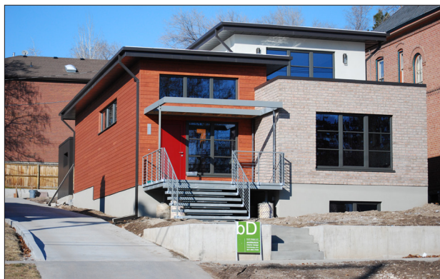
A new house in the Avenues historic district designed to respect its historic setting and to be the first certified "passive house" in Salt Lake City.