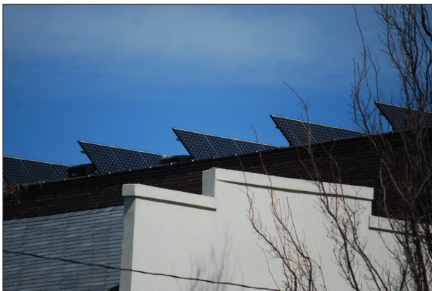
Solar collector panels are becoming increasingly affordable and are being developed in a variety of forms and scales, as with this installation on a traditional apartment building.