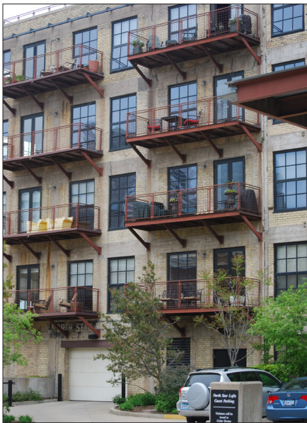
Adaptation of an early industrial building to new residential units reinvests in the original building, its history and the culture of the city.