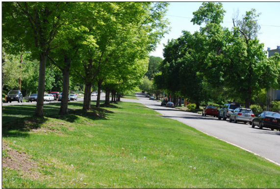
The city's historic parkways and park strips combine mature neighborhood landscape, open space and identity, with an attractive, walkable character.