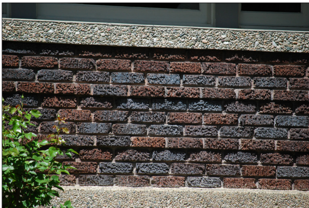
A decorative choice and use of materials, detailing and textures combines thermal mass with low maintenance.

A further point on historic character is that original and early materials have a patina of age and maturity which does not compromise their integrity or performance. It adds immensely to the historic character of an older building and neighborhood. It is a characteristic defining time, history and maturity that should be retained.