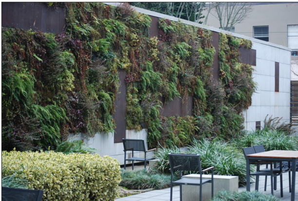
Greening an urban courtyard need not be limited by site area or to ground level landscaping.

S.40 Maximize landscaped areas while minimizing utility areas.