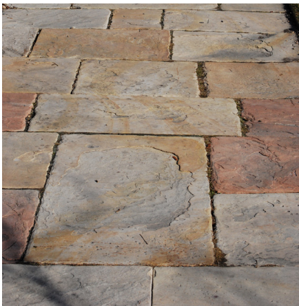
Reused historic sandstone paving.