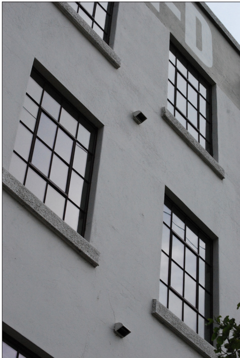
Rehabilitation of the building here involved retaining, repairing and upgrading the original steel framed windows.