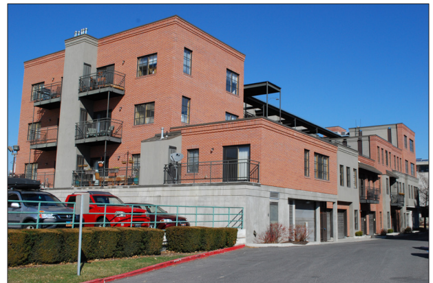
Recent multifamily design composed with varied volumes and massing, private and communal open space, and constructed using solid, durable materials.