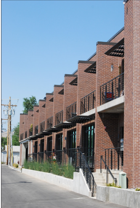
Contemporary multifamily development affording shaded private balcony space and first floor level windows.