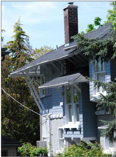
Projecting eaves provide protection from precipitation and solar exposure.