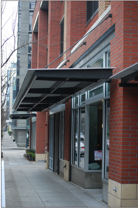
Durable materials frame and support the shade and shelter provided by both deep window reveals and fixed canopies for the sidewalk use and street level retail.