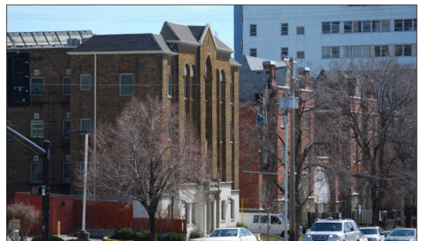
Urban form here reflects proximity to the Downtown with a sequence of historic apartment buildings providing good urban density, livability and varied architectural interest and character.