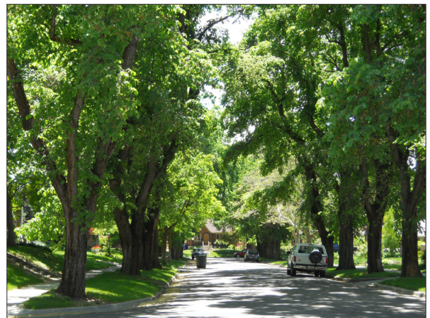
Mature tree cover and landscaping temper the urban temperature extremes with much needed shade, filter and renew air quality, while creating attractive street character.