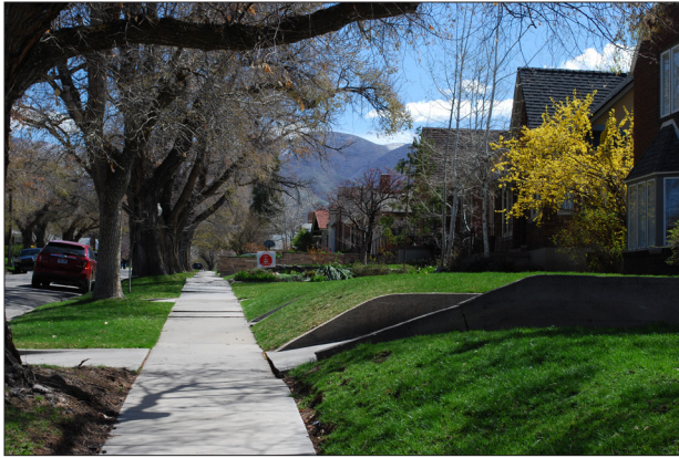
The past and current investment in a traditional neighborhood embodies many of the characteristics and principles of a sustainable form of development.