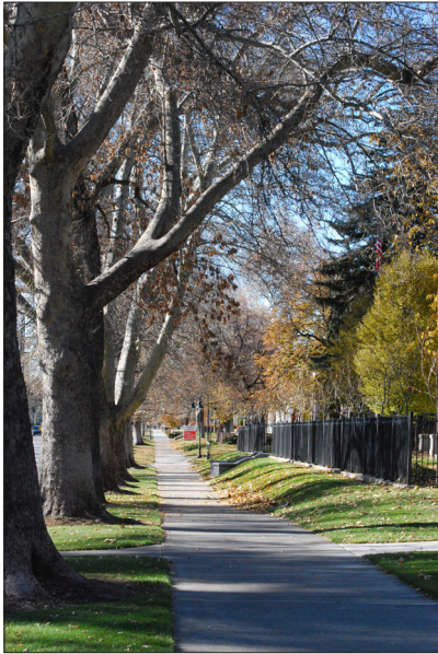
The characteristics of mature deciduous tree cover help to moderate the extremes of the seasons, while enhancing atmospheric quality.