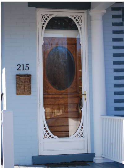
An exterior storm door revealing the detailing of the original behind.