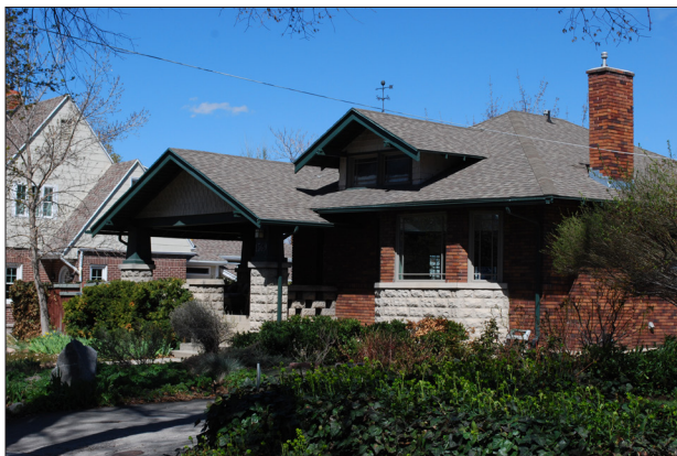
The architectural character of the building incorporates a variety of traditional design characteristics such as external porch, deep eaves, natural ventilation and solid masonry construction, ensuring efficient energy management and conservation.