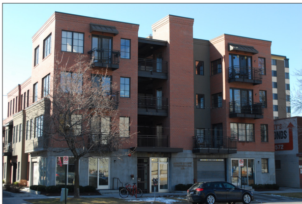
Recent multifamily construction which includes a variety of sustainable characteristics as well as sensitive context design.

By contrast, an older building, of traditional and robust construction, does not have a life span determined by the designed operational life of its components, nor the inflexibility of its design and construction methods, but, alternatively, by the understanding and informed periodic minor care it receives, usually at minimal cost.