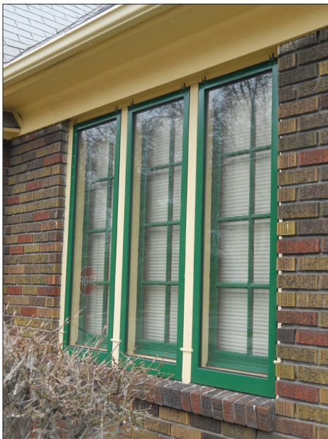
Historic wood windows, enhanced with a traditional design of external storm window, will generally outlast and outperform a replacement window.

Understanding how these characteristics and dynamics are designed to work will ensure that energy efficiency enhancement strategies are designed to be complementary, capitalizing on these advantages, while accentuating their attributes and efficiency.