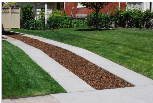
Drive strips or wheel strips are a historic solution to the contemporary issue of reducing impervious surface and runoff.