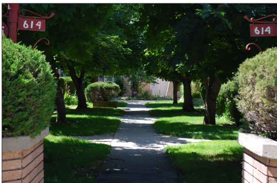
The landscaping of this historic garden apartment development combines cultural and environmental, sustainable development characteristics with a unique residential atmosphere.