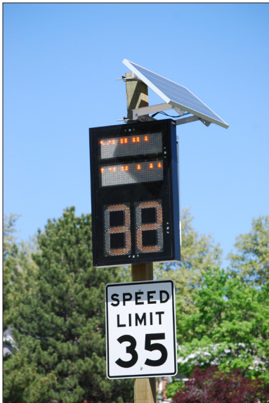
Small scale solar panels and their adaptability.

Solar collectors are either thermal, where the sun directly heats water in a closed grid, or photovoltaic, where the energy from the sun is converted to electricity through a series of chemical cells. Solar collectors for urban building use are usually in the form of panels, although becoming increasingly available in the form of smaller units, solar laminates and roofing shingles.