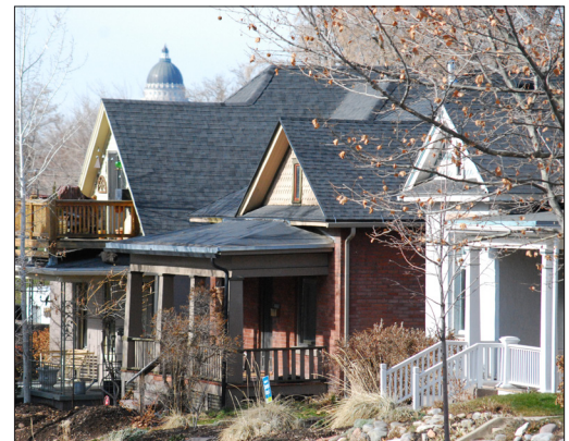
Salt Lake City lies within an area regarded as seismically active.