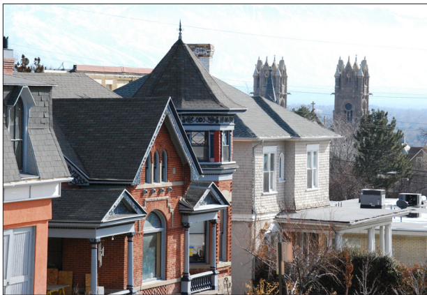
Vista from the Avenues highlighting architectural variety in historic and topographic contexts.

10.1 Seismic retrofitting of a historic building should be designed in a way that has the least impact on the architectural integrity of the building.