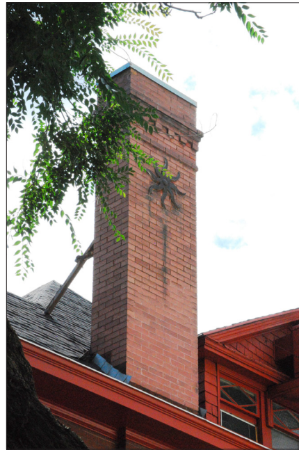
Seismic bracing on one of the many decorative chimney stacks in the city.