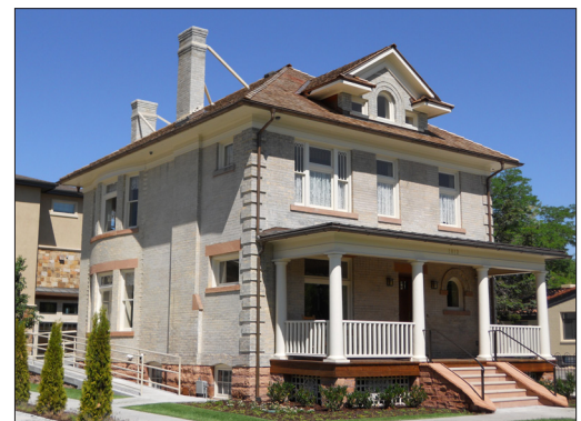
The Stanley F. Taylor building, a residence dating to c. 1906, was recently seismically upgraded as part of an extensive rehabilitation.